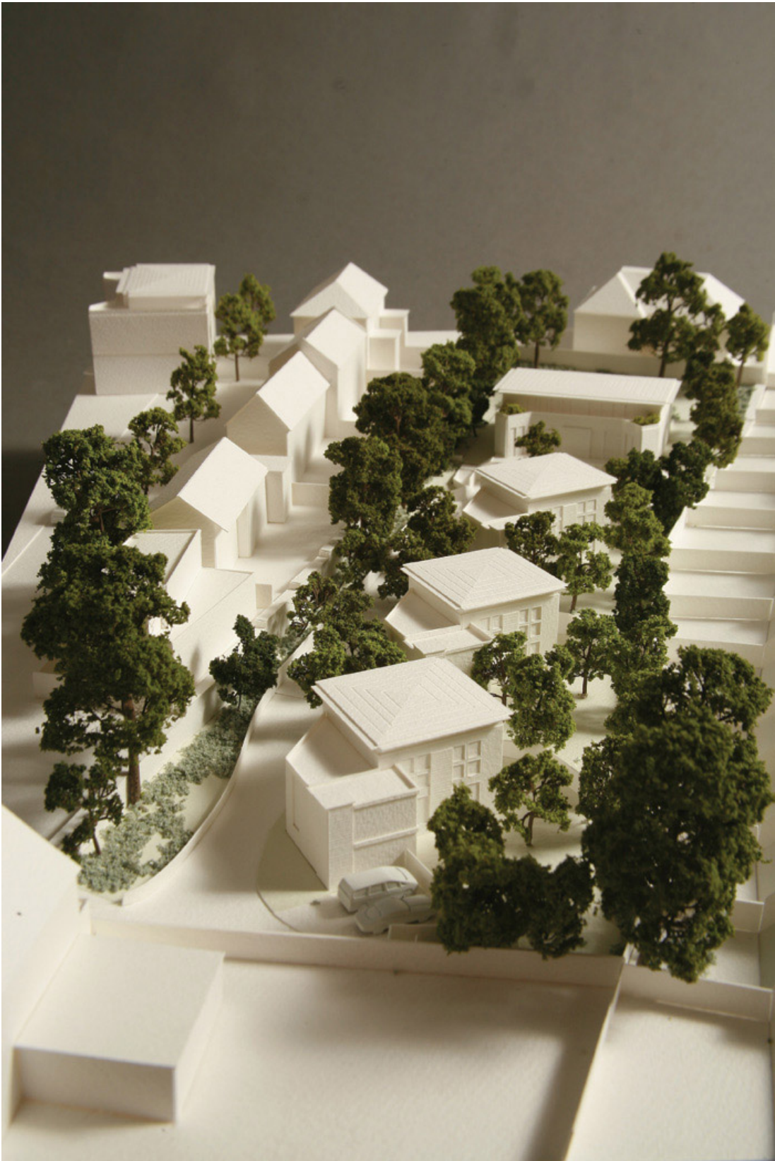
Ash Grove N10 House No.s 4 & 5 scale 1:100