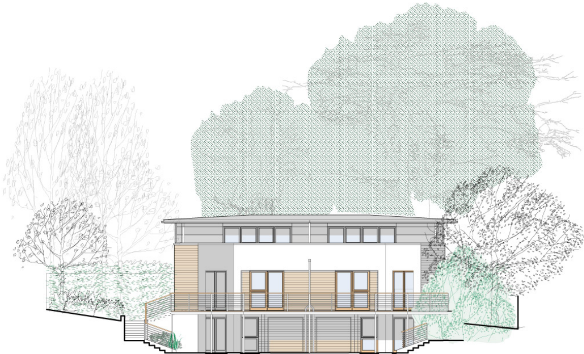
typical easterly elevation houses 4 and 5