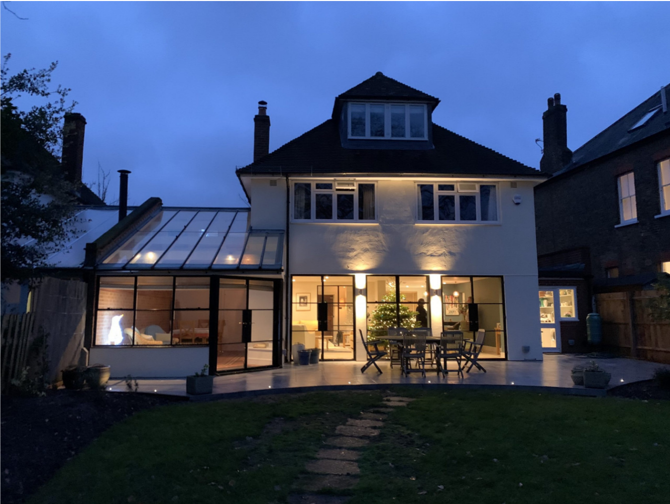
The development is located in Dulwich, South London.