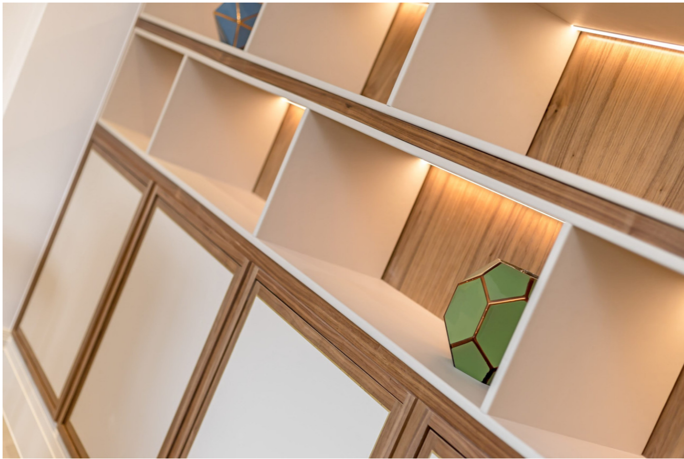
The development is located in Mayfair, Central London.