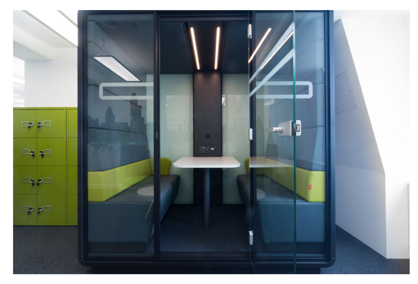
The development is located in Camden, Central London.